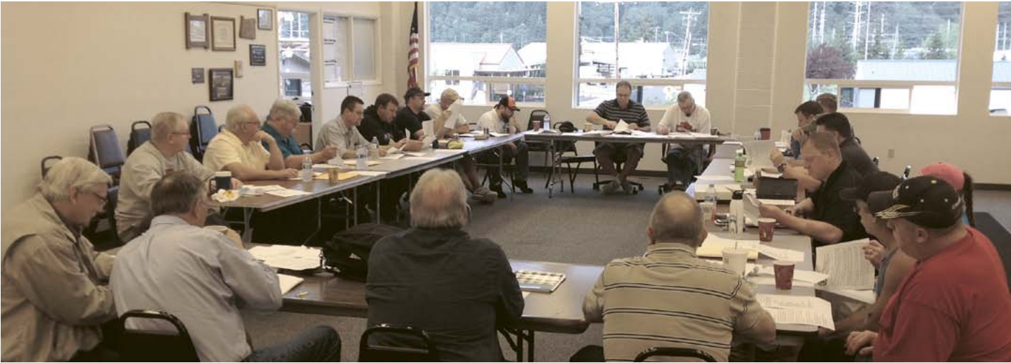
The roomful attending the OR-ID-UT Area Council meeting is pictured as the meeting progresses at Local 13's union hall in Toledo, Oregon.